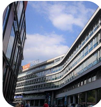
Chamber of Economy of the FBiH